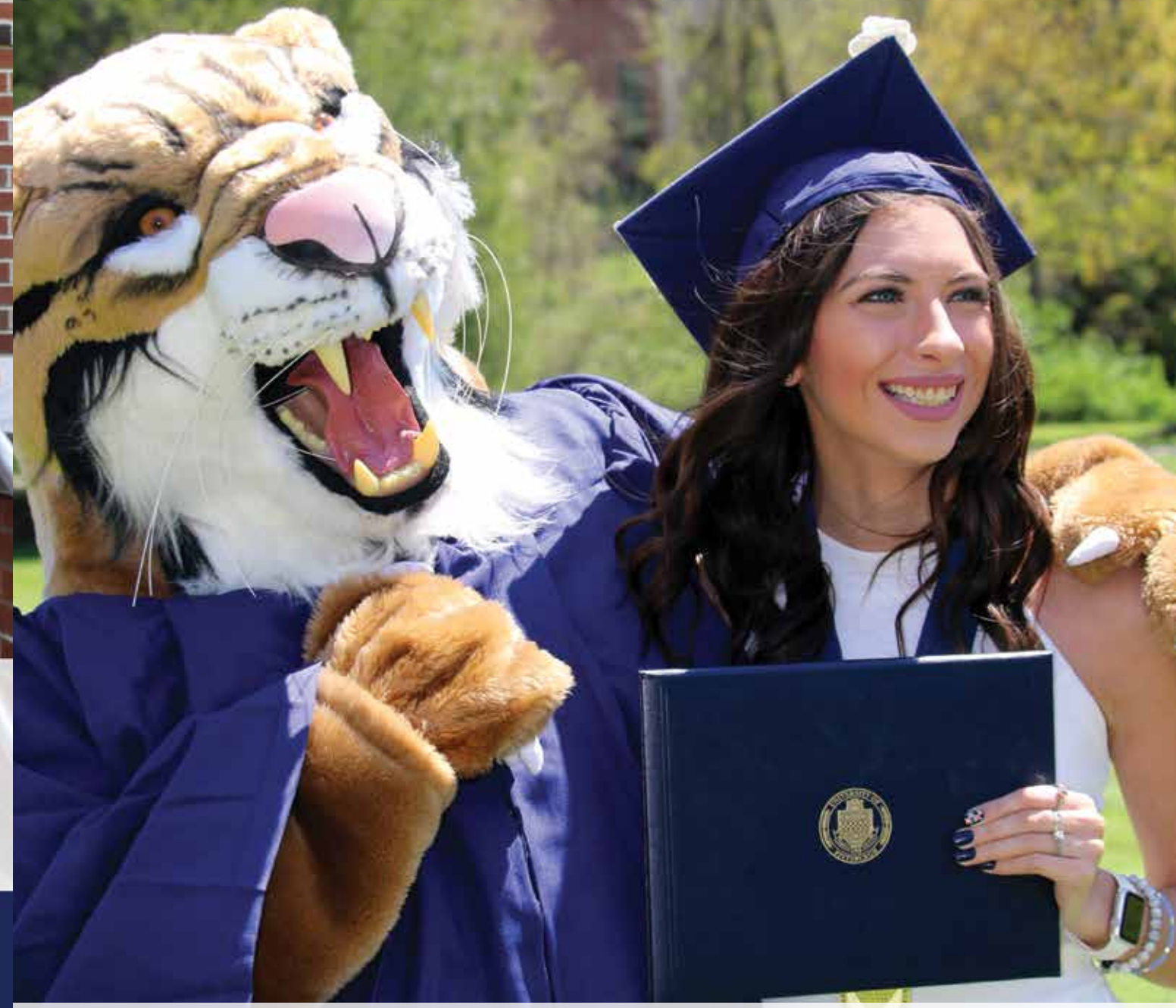
Table of Contents Summer 2019

Hours (M-F): 8:30 a.m. to 5 p.m. 724-836-9928 • 112 Chambers Hall